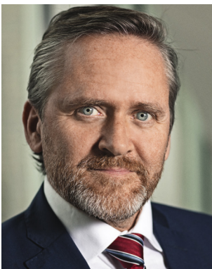
Anders Samuelsen Minister for Foreign Affairs

The world is constantly searching for new and better solutions in health care. Denmark is the place to develop these solutions.