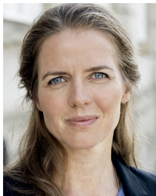
Ellen Trane Nørby Minister for Health